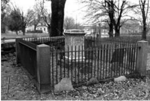
Figure 11. Trinity Cemetery, Main St. - BRD.806