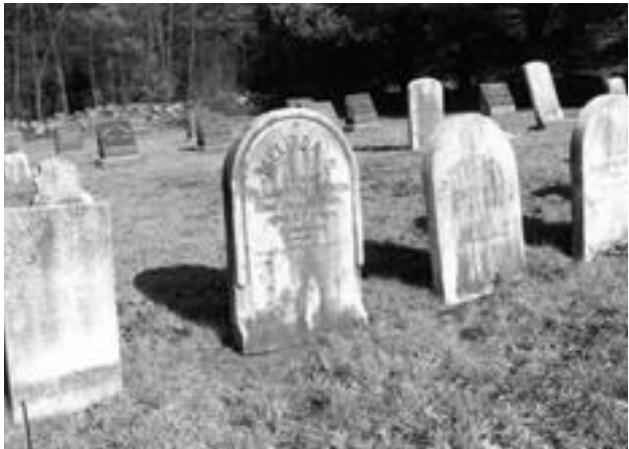
Figure 7. Conant St. Burial Ground – Conant St. - BRD.803.