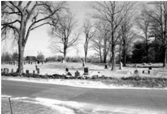
Figure 13. Vernon St. Cemetery Vernon St.- BRD.812