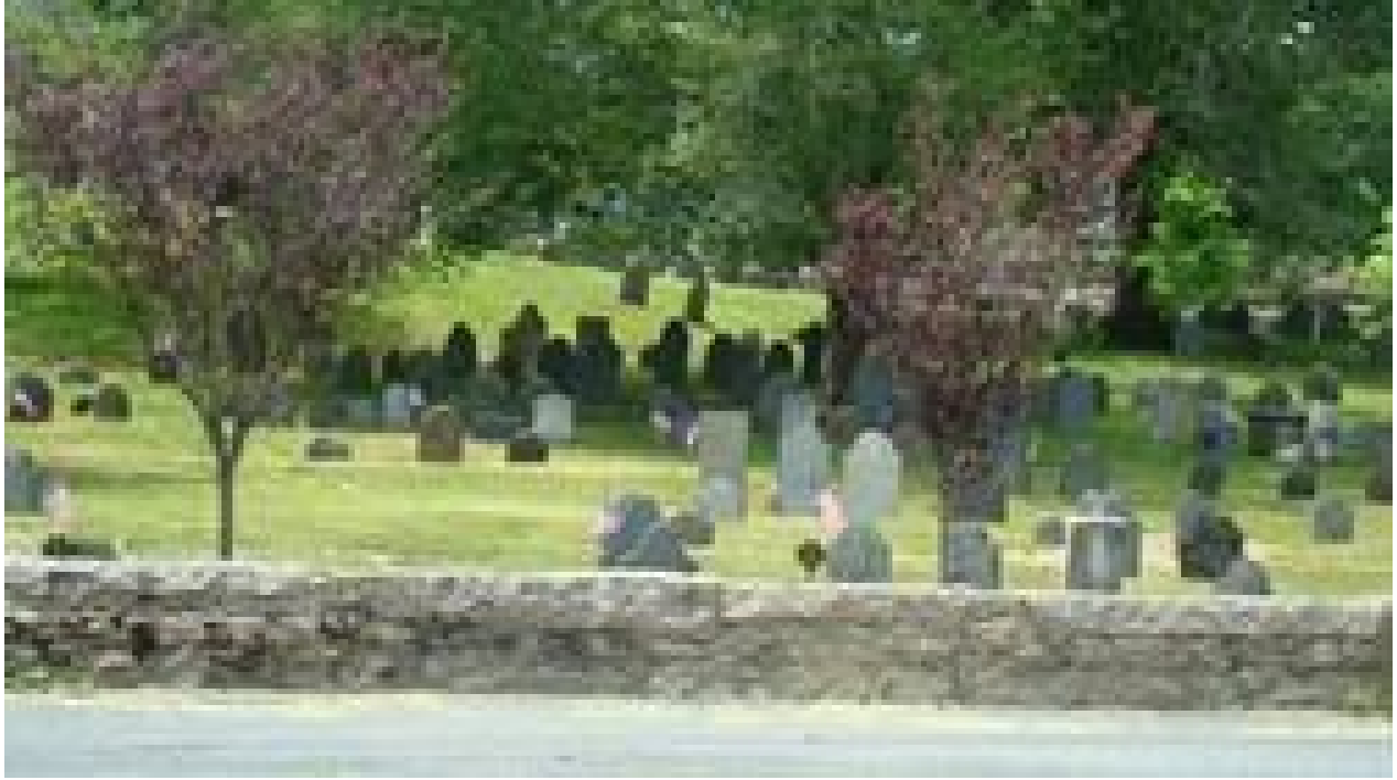
Figure 3. First Cemetery (1717) Summer St. Bridgewater, MA. BRD. 811