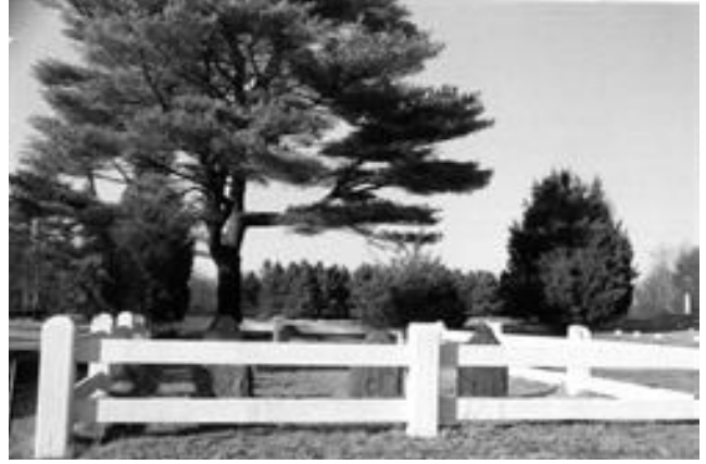
Figure 8. Smallpox Cemetery, Conant St.- BRD.804