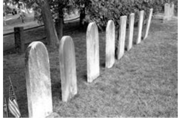
Figure 14. Pratt Town Burial Ground, Walnut and Orange St. - BRD. 813