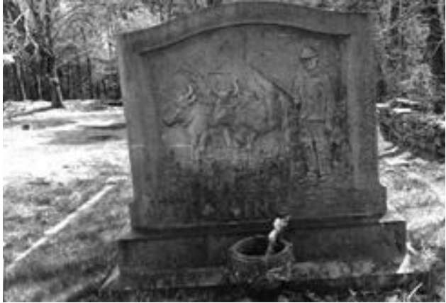
Figure 5. Hillside Cemetery, Auburn St - BRD.800