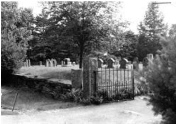
Figure 12. South St. Cemetery, South St. - BRD.810