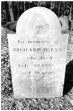
Figure 6. Cherry St. Cemetery, Cherry St. - BRD.802.