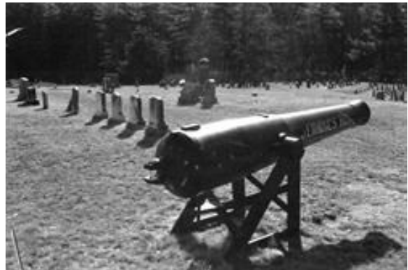
Figure 9. Figure 10. Jennings Hill Cemetery, High and Pine Ss. - BRD.805