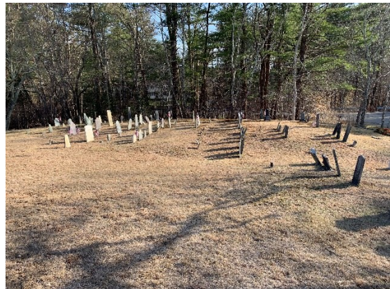
Figure 10. Jennings Hill 2023